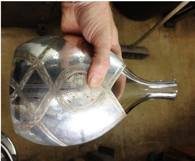
Testing the pour