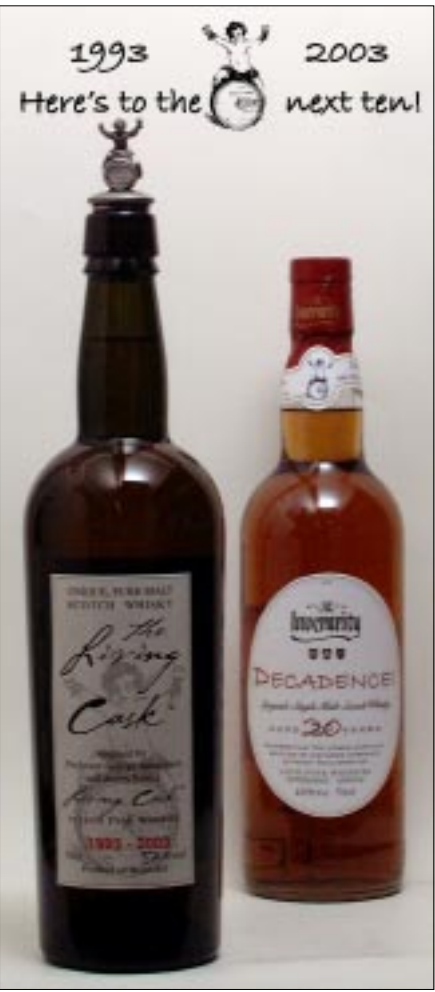
"A friend of mine held some mixed Clyne Lish and Glenlivet of mine to be the best whisky he had ever drunk".