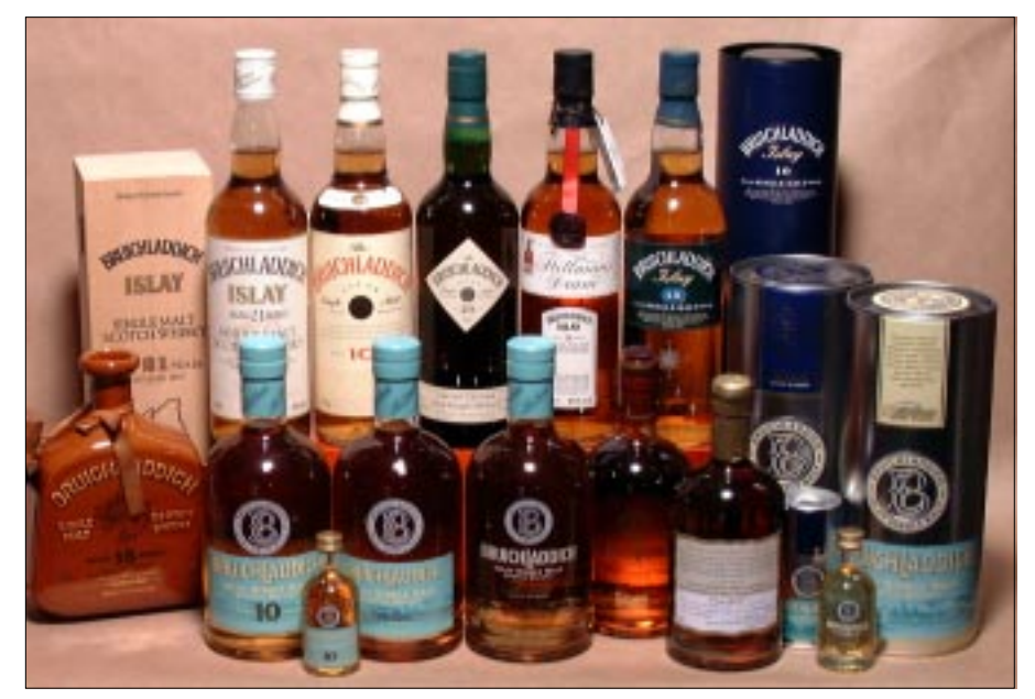
OFFICIAL, OWNERS OR ORIGINAL BOTTLINGS (OB)

Single Malt whisky is one of four types of Scotch. The most common is blended whisky , a mix of many different malt and grain whiskies prepared by a blender using his sense of smell and years of experience. 95% of all bottled whisky sold is blended whisky and it is appreciated the world over for its satis-