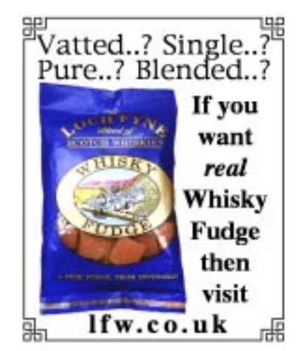
PROPHETIC Our advertisment from Whisky Magazine, January 2004

"Everyone agrees with us," they said when I put this to them. So I asked as near to everyone as I could. No-one thought it a good idea. In fact, everyone